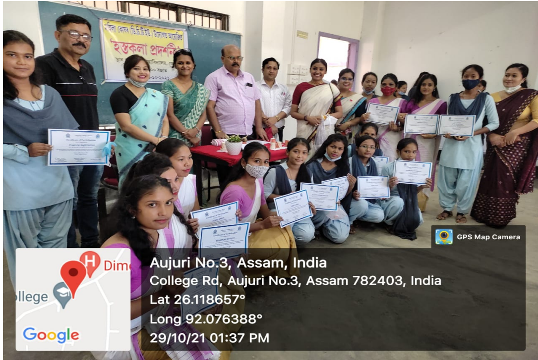
Handicraft exhibition on 29 th October 2021.