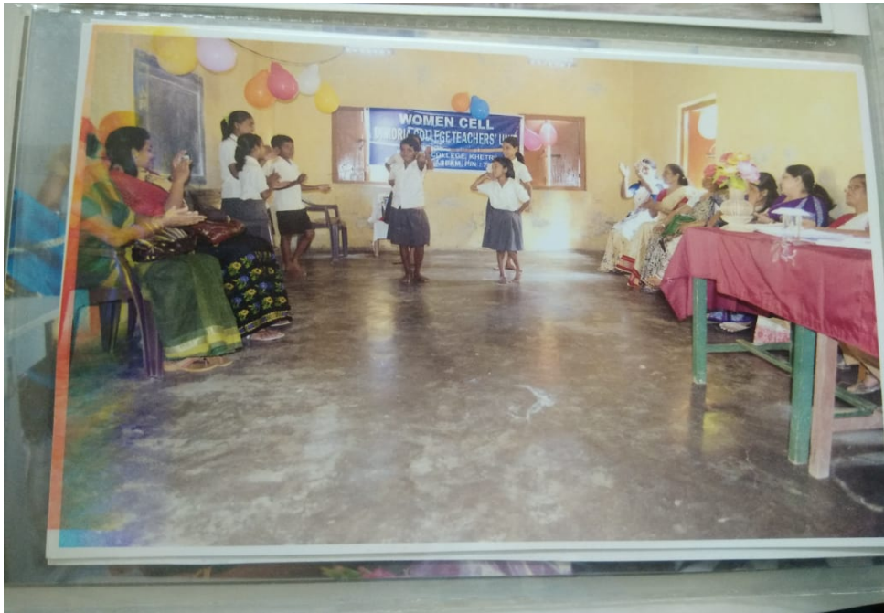
Childrens Day Celebrated in the Nearby L.P. School on 14 th November 2017.