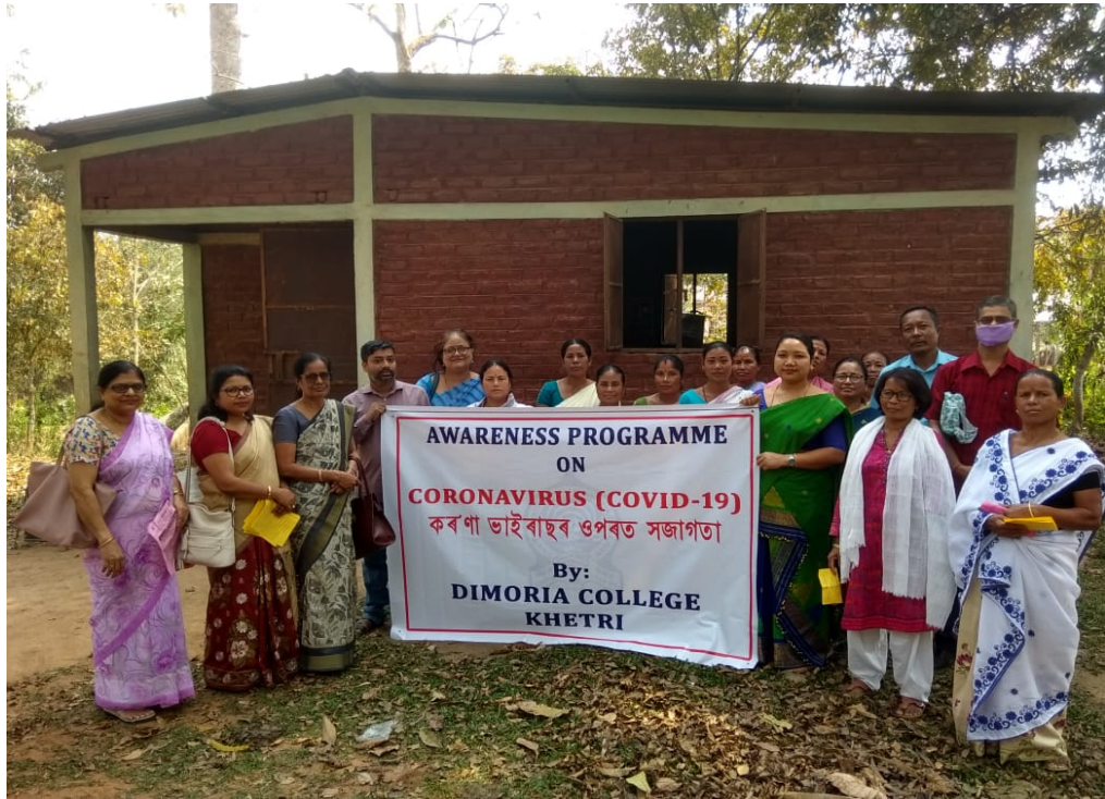
Awareness programme on Covid-19 and distribution of Sanitizer and Mask to the local dwellers of Khetri on March 2020.