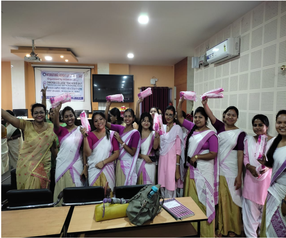
Distribution of sanitary napkins among the girl students on 8 th March 2022.